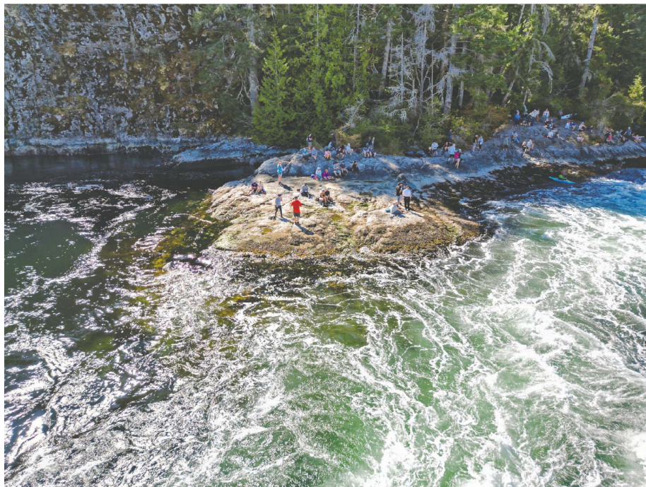
A view from the air of the Skookumchuck Rapids that oxygenate the water for a variety of sea life such as shellfish and ling cod.

The Sunshine Coast is awe-inspiring with locations that leave you breathless