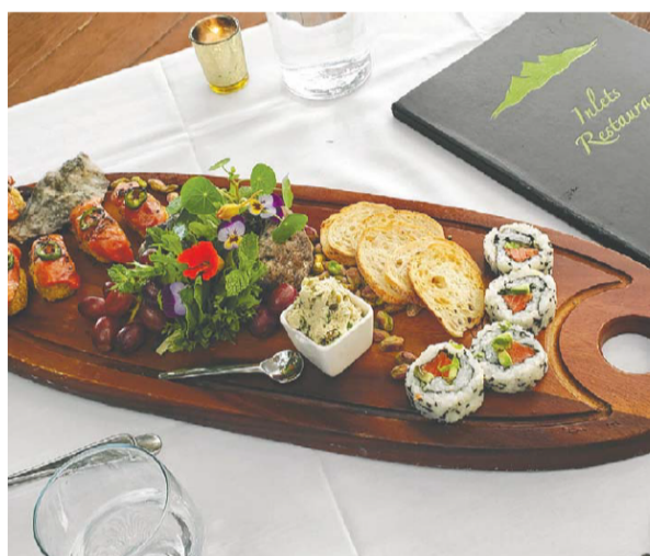
A charcuterie board from Inlets Restaurant.