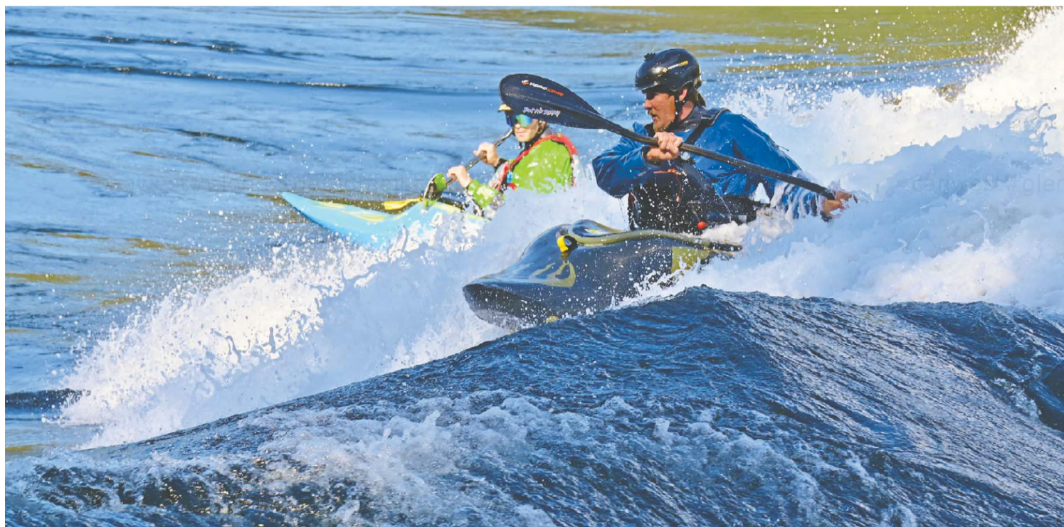
Kayakers from all over the world come to challenge the Skookumchuck Narrows.