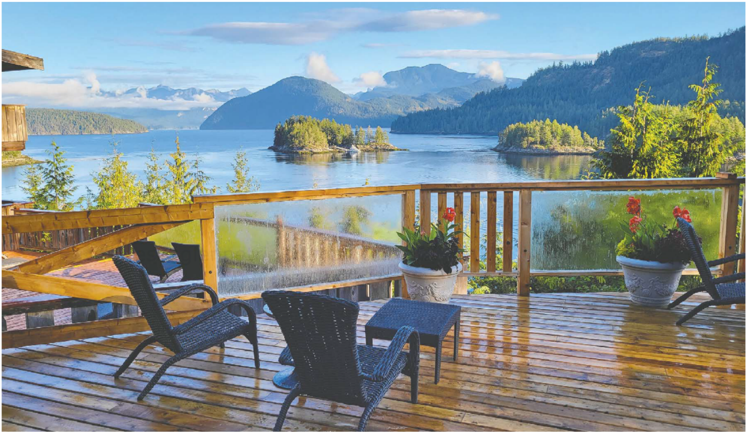
The view from one of the decks at the West Coast Wilderness Lodge.

Two overlooks offer views for either incoming or outgoing tides.